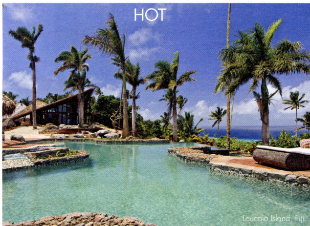
Laucala Island, Fiji

Slope-side or seaside, these hot and cold spas prove that pampering works in any weather. JANE LARKWORTHY takes their temperature.