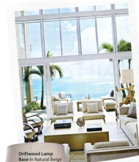
Driftwood Lamp Base in Natural Beige (shade not included), $420; alldrifwoodfurniture.com