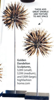
Golden Dandelion Sculptures, $289 (small), $299 (medium), and $309 (large); highfashionhome.com

THESE ADD GREAT SPARKLE AND TEXTURE TO ANY SPACE