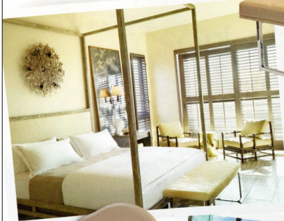
Bellagio Bench , $1,495; 514/697-9000 or outpost.original.com