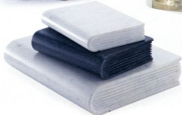
Kelly Wearstler Marble Books in White, Black, and Gray, $110-$275 each; 800/558-1855 or e-mail decorativehome@bergdorfgoodman.com

WE'RE BIG FANS OF WEAVING TOGETHER MARBLE, NEUTRAL FABRICS, SUBTLE PAINT COLORS, AND ORGANIC SHAPES