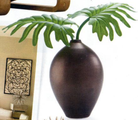
Ceramic Vase (HV120) in Gold Bronze, $66; 877/327-4692 or ecrineyork.com

THESE ADD GREAT SPARKLE AND TEXTURE TO ANY SPACE