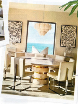
Polished Brass Hans Pedestal, $895; 800/963-0891 or jonathanadler.com