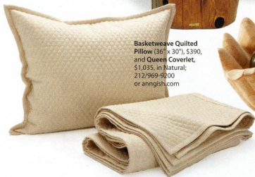
Basketweave Quilted Pillow (36" x 30"), $390, and Queen Coverlet , $1,035, in Natural; 212/969-9200 or annjish.com

WHAT YOU'LL SEE INSIDE Modern architecture decorated with beachy neutrals and more than 20 different kinds of marble WHAT YOU'LL SEE OUTSIDE Uninhabited islands on the horizon surrounded by the azure blue waters of the Meads and Barnes bays